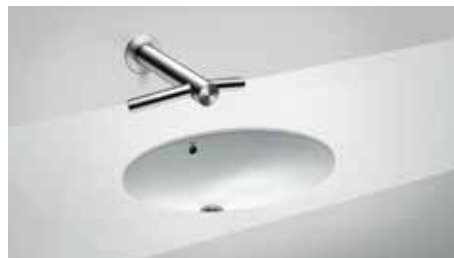
Roca Berna vitreous china basin 327871001

Under counter External dimensions L x W 560mm x 420mm