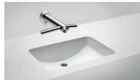
Kohler Ladena 2215

Under counter External dimensions L x W 591mm x 413mm (23-1/4" x 16-1/4")