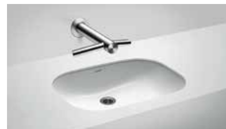
Duravit D Code vanity basin 33856

Under counter External dimensions L x W 590mm x 465mm