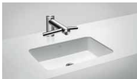
Villeroy & Boch Architectura 417760

Under counter External dimensions L x W 540mm x 340mm