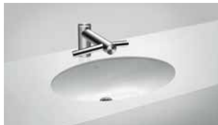
Villeroy & Boch Evana 614400

Under counter External dimensions L x W 615mm x 415mm